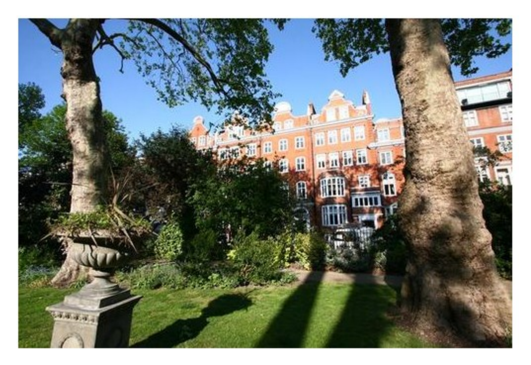
Arbitrage – Real Estate investments in London